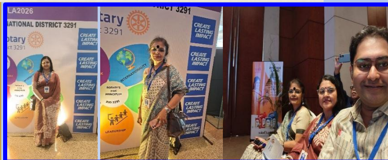
Our proud participation in DLA-2026 held on 18.05.2026 at Hyatt Regency Kolkata.